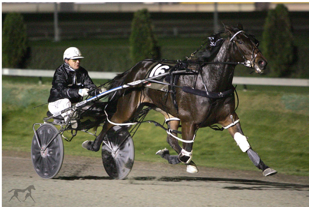
2006 New Zealand Oaks Winner, Western Dream

Discover The Performance Behind The Pedigree