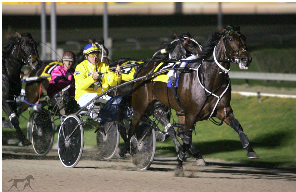
One Dream wins the 2007 New Zealand Oaks