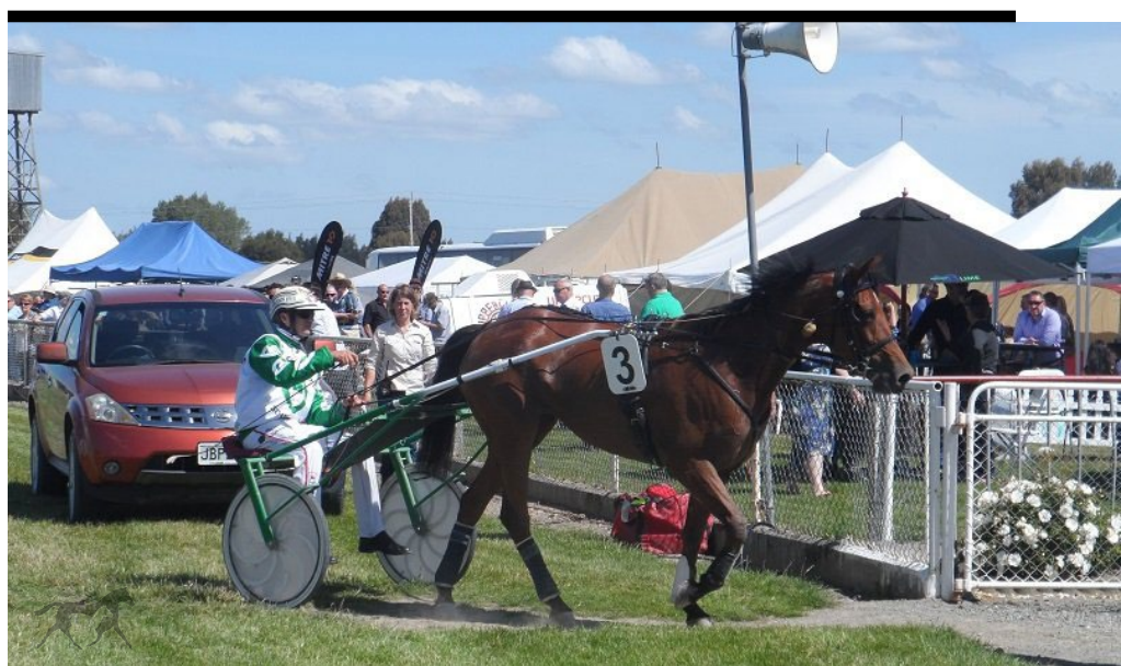
Queen Kenny (7m Monarchy/Nice One Kenny)

A recent nominee for Southland Horse of the Year (winner : Costa Del Magnifico) and New Zealand (Hanley Formula) 5YO and older Trotting Mare (winner : Quite A Moment sixteen votes; Queen Kenny eleven votes) didn't mean that Queen Kenny's recent successful season was left unrewarded. She was crowned Southland Standardbred Breeders Aged race mare for 2015/16 season.