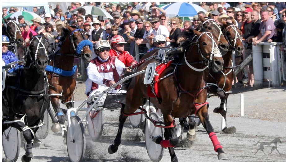
Smiling Shard (10 h Grinfromeartoeear - Sly Shard) winning the 2010 Kaikoura Cup a feat he repeated the next year!