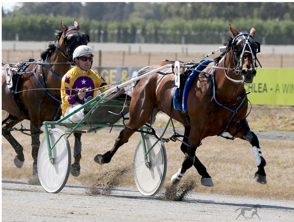
New Years Jay (9 m Washington VC - Jay's Glen) winning the 2015 Prodigal Seelster Speed Final in 1.54.6

He has prepared more than 1400 galloping winners, is a former successful jockey and a highly regarded studmaster, trainer, owner and administrator. He was made an Officer of the New Zealand Order of Merit (ONZM) in the New Year Honours list announced on December 31 last year.